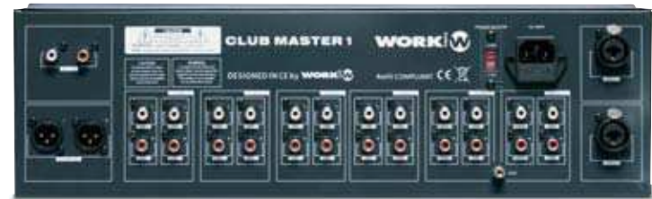
Master output control.