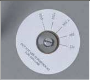
Output power selector (8 Ω and 4 output Line positions 100 V).