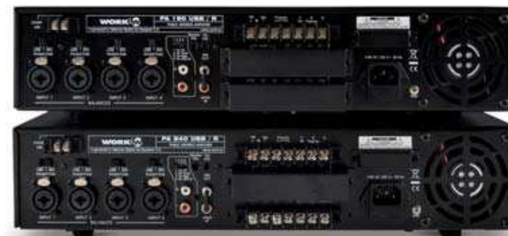
PA 190 USB/R / PA 240 USB/R